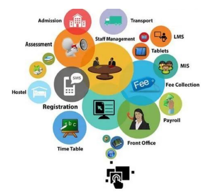
Fig 1 Smart application for students