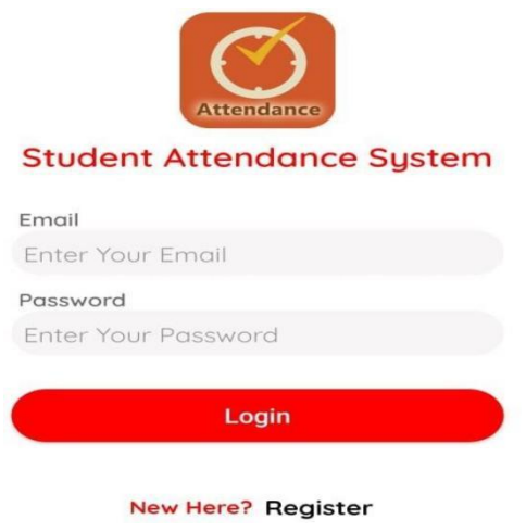
Fig 3 Students attendance system

There are three types of user's i.e Administrator, Reporter and guider. Any user who wants to use the attendance system must have user name & password which admin can grants it. So it confirms that it is a authorized user Attendance system have mainly three parts, i.e first part is admin session part , where one can login to system and edit on all database tables. The second part is that the instructor session, where one can login to system for marking attendance and third part is reporter session, that also login to system where attendance can be viewed as well as report all these tasks. When user open the system login page will show . It consists of three types mainly Text fields, button and labels. The Two text fields for username and password.