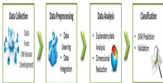
Fig.1 The proposed approach

from the UN Human Development Project. The data contains of the human development index, GDI, healthy index of each country in the world. However, these data are quite dirty. It cannot be used directly as the input data for the learning process. Therefore, the second process is data pre-processing. Data pre-processing is used to increase the data quality. By increasing the quality of data results to the increasing number of prediction accuracy and consistency. The processes included in this process are data cleaning and data integration. The routine processes that should be done are filling the missing values, reduce the noise and identify the outliers