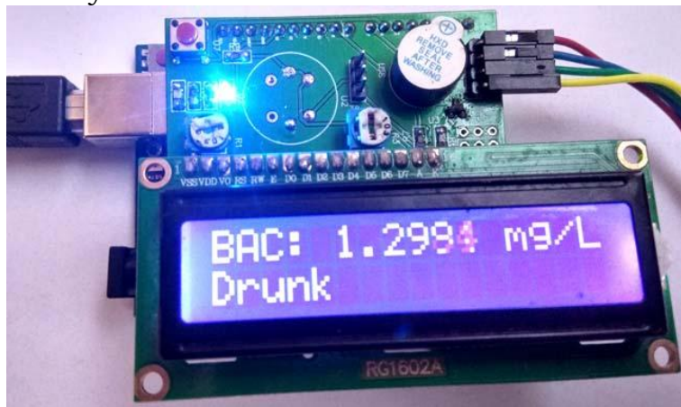
Fig 3 Hardware Kit Result 1