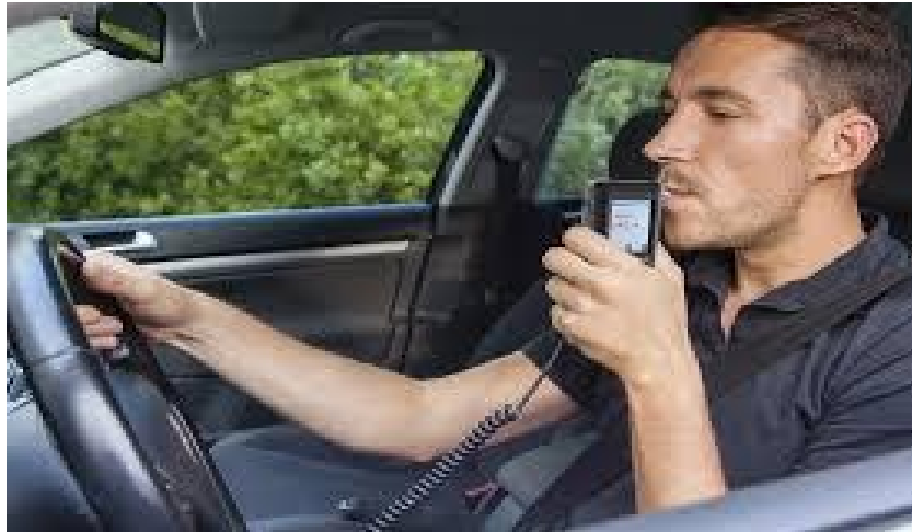
Fig 1 Module sample