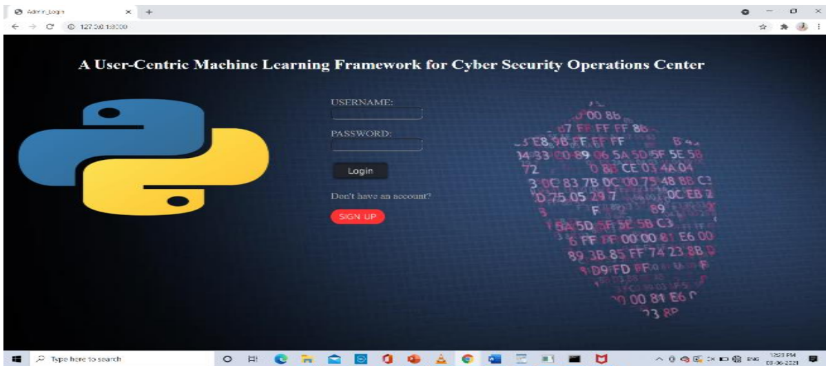
Fig 1: User login page.