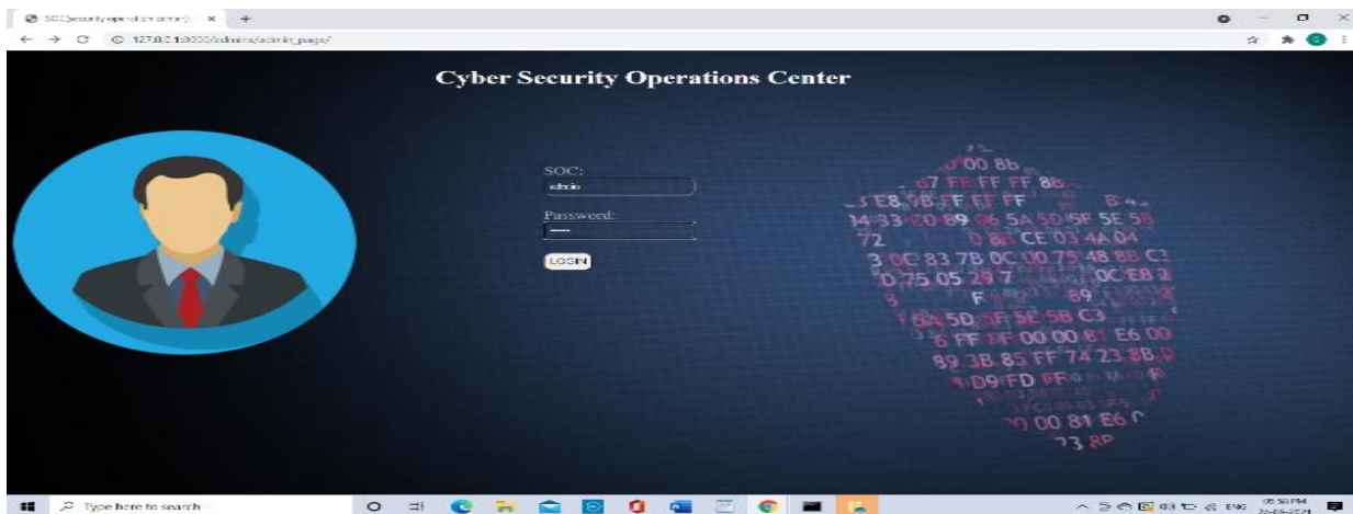
Fig 2: Login credentials for soc.