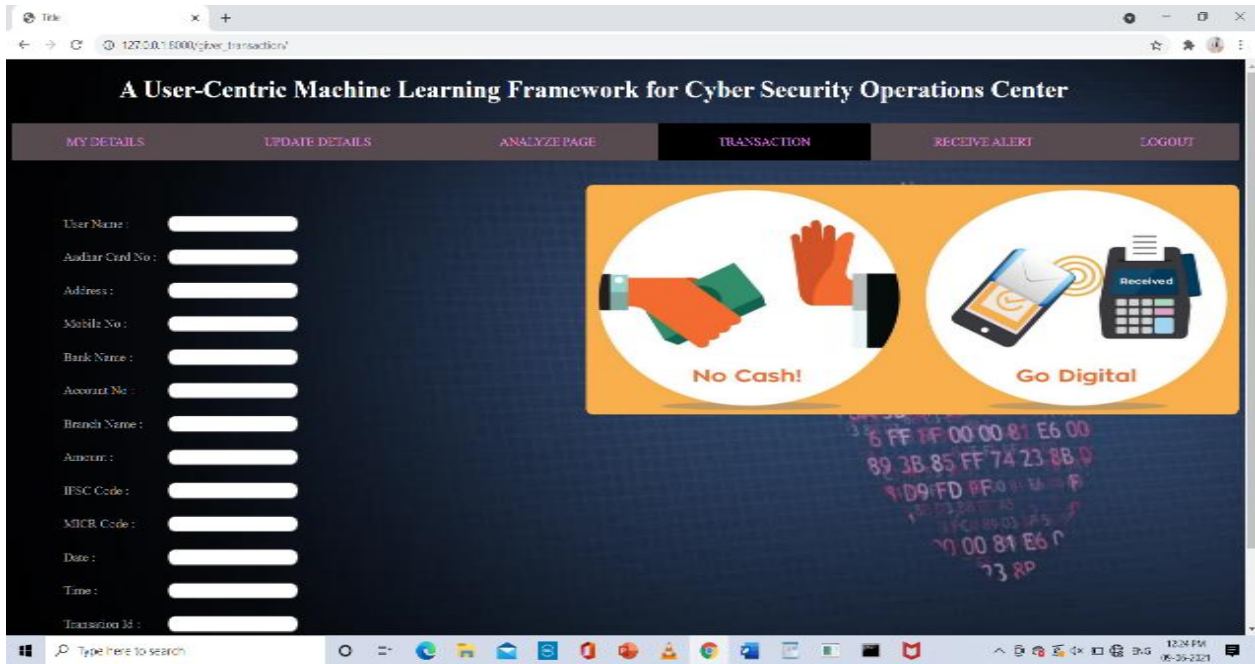
Fig 3: Transactions of the user.